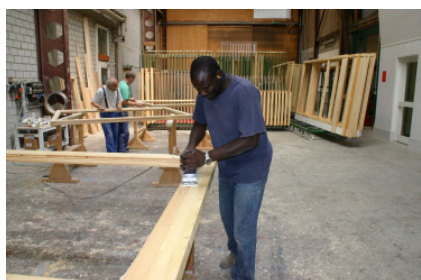
Stage 6 Timber finishing