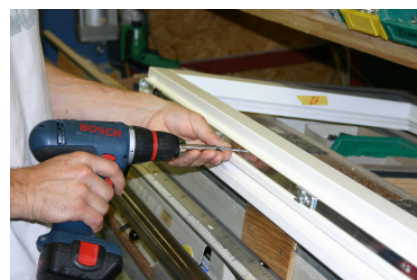
Stage 9 Ironmongery