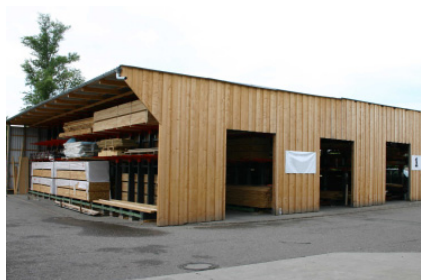
Stage 1 The timber store