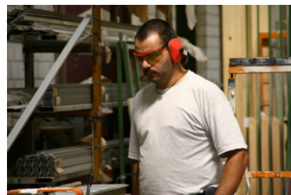
Stage 8 Aluminium cutting