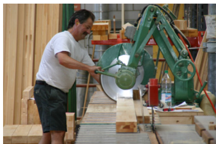
Stage 2 Cutting the timber