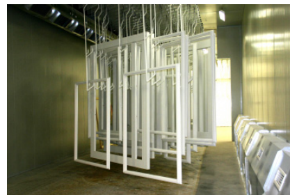
Stage 7 Spraying