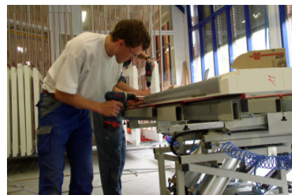
Stage 11 Assembly