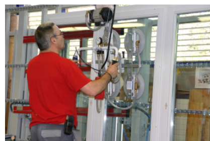
Stage 12 Glazing