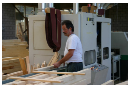
Stage 3 Planing & sanding