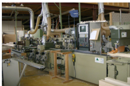
Stage 4 CNC machining