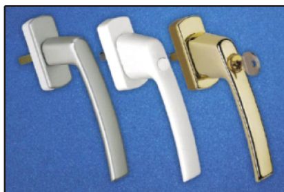
Types (left-right): Non-locking Push button operated key lockable

Glutz 5616DCV handle drive (with cover) for authorised window operation only.