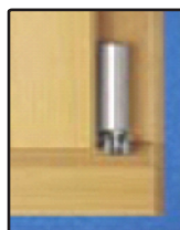
Maco Multi Trend DT Hinge