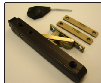
MACO Multi Vent Tilt Restrictor

Where there is a requirement for secure window restriction, the MACO Multi Vent Tilt Restrictor can be used.